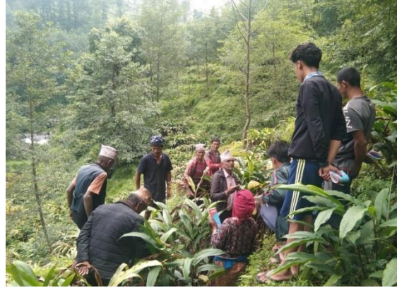
participants of Cardamom Refresher training (Round-II) @ Aarughat RM-2, Ghamlina.