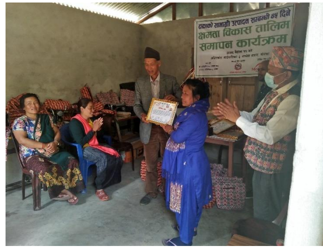
Some photographs of Dhaka Knitting Training at Ajirkot RM, Bhachchek