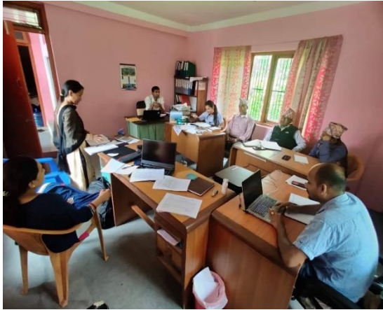
Introductory meeting with newly elected bodies of Aarughat RM @ Aarughat RM.