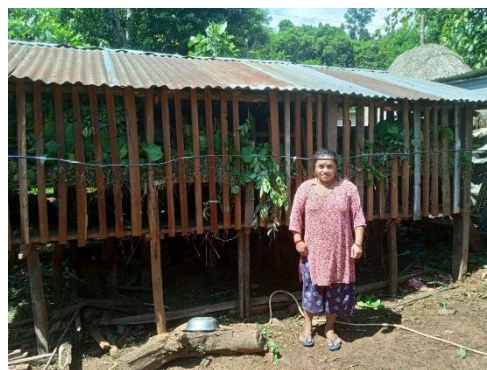
After goat shelter support