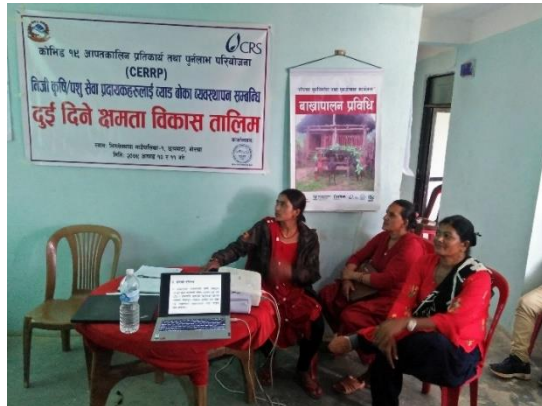
Female participants of Breeding buck management training @ Bhimsen Thapa RM-1, Ghyampeshal.