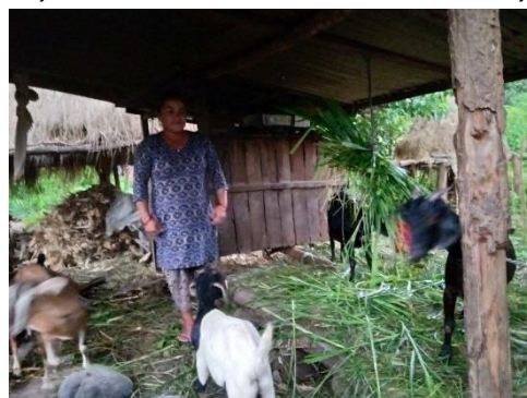
Before goat shelter support