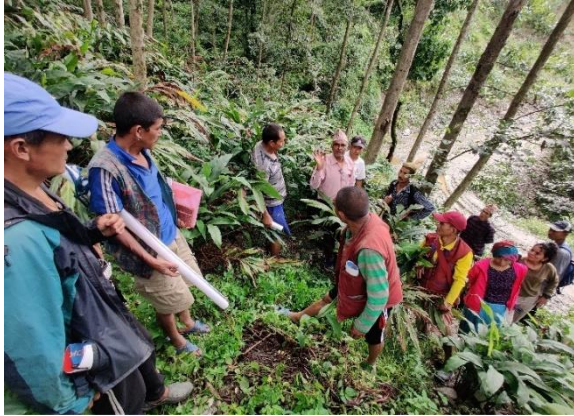
participants of Cardamom Refresher training (Round-II) @ Aarughat RM-1, Dongchet.