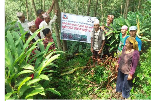
participants of Cardamom Refresher training (Round-II) @ Aarughat RM-7, Kudule.