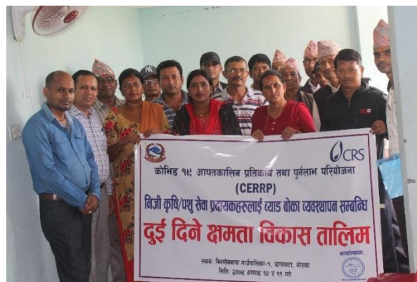
Group Photo of Breeding buck management training @ Bhimsen Thapa RM-1, Ghyampeshal.