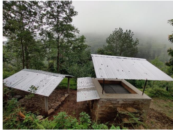
Construction completed improved cardamom dryer of Aarughat RM-2, Ghamling.